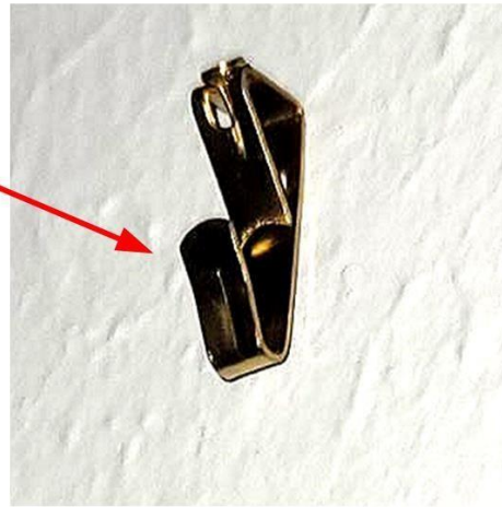
Single mounting hanger in drywall