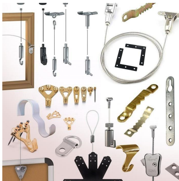
Image 1.1 - Examples of Typical Mechanical Wall Hanging Hardware

Image 1.1 shows typical (not all) mechanical wall hanging hardware.